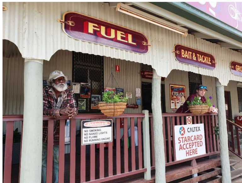
Armbrust & Co Store – Coen