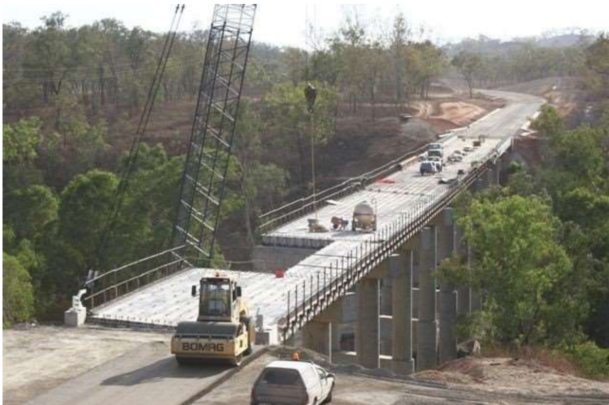
Building of the West Normanby River Bridge

Pursuant to Section 116 of the Local Government Regulation 2012 , for the 2022/2023 financial year, Council has not made, and will not make, a resolution limiting an increase of Rates and Charges.