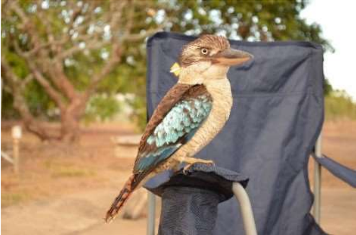
Blue Winged Kookaburra – Coen Airport