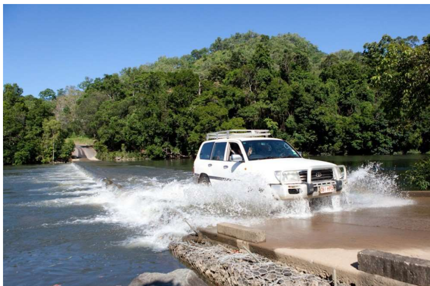
Old Bloomfield Causeway