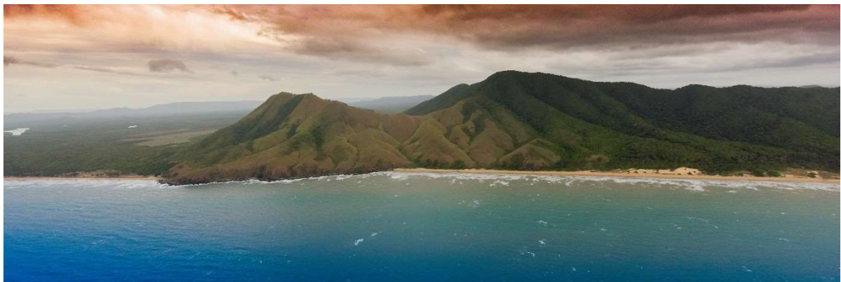
North Shore - Cooktown