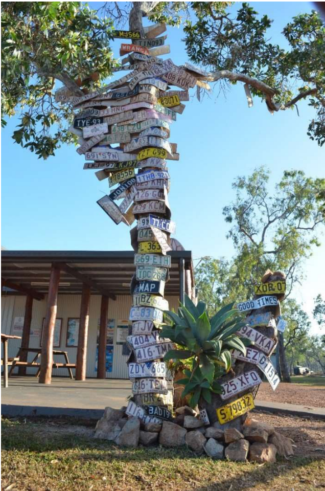
Bramwell Junction Roadhouse – Number Plate Tree