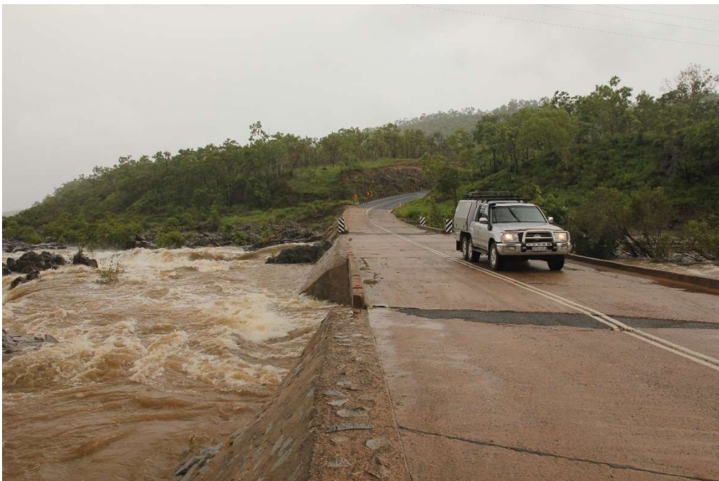
Little Annan Bridge