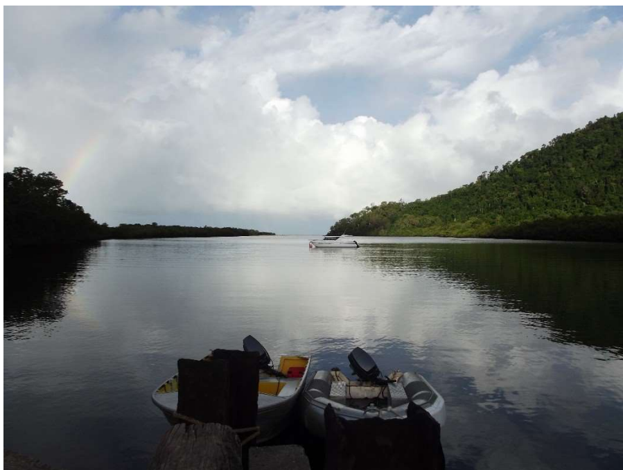
Boats on Bloomfield River

Water service charges are calculated per water meter as detailed in the table below. Vacant service charges to apply to all vacant parcels of land as well as all land that does not have planning approval for either residential or commercial use within the Coen, Cooktown, Lakeland and Laura Water Areas on the basis that a water service is available to the land as water infrastructure has been installed ready to supply the land once it is occupied. Water charges will be levied in two equal half yearly amounts.