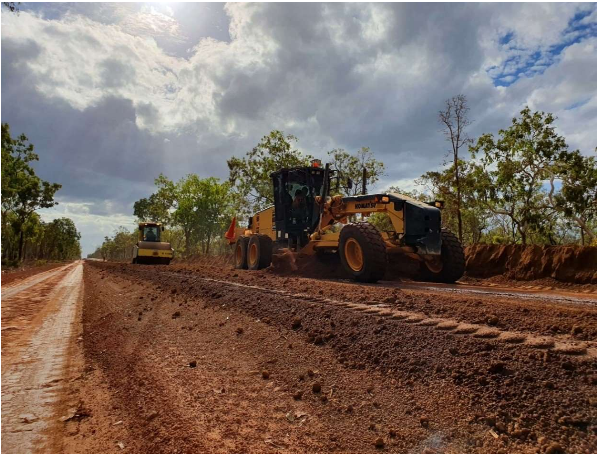
Aurukun Access Road – Bitumen Seal

Each parcel of rateable land will specially benefit to the same extent from the purchase and maintenance of equipment by each Rural Fire Brigade in the current or future financial years, because each such parcel is within the area for which the brigade is in charge of firefighting and fire prevention under the Fire and Emergency Services Act 1990 .