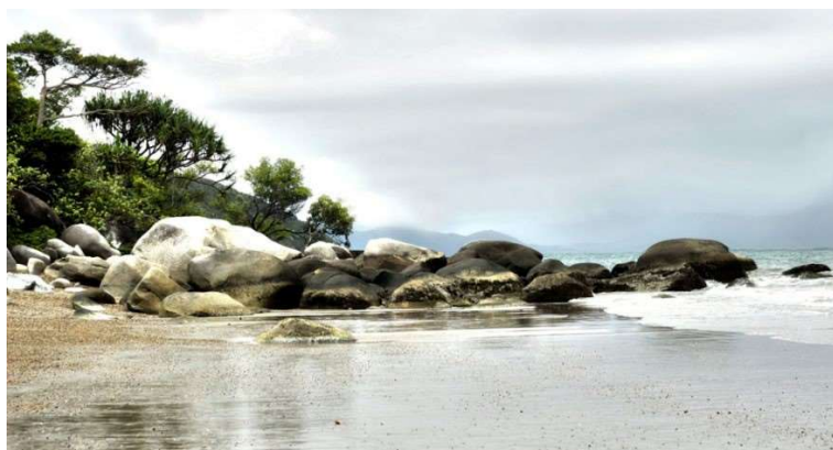
Quarantine Bay Beach - Cooktown